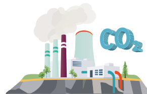
Carbon Management and Gas Transition