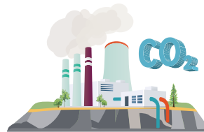
Carbon Management and Gas Transition