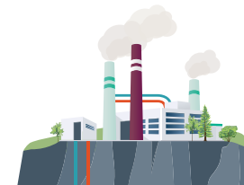
Sustainable Heat - Geothermal